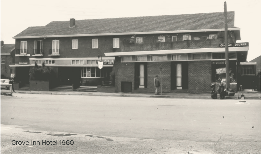
Grove Inn Hotel 1960